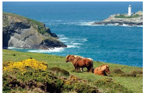
Wild Ponies, Shetland Islands

Boston is known as the 'Cradle of Independence'. Follow the 'Freedom Trail' focusing on important early American history. See the Paul Revere House, the USS Constitution, and other historic sites along the Freedom Trail, enjoy the lovely 19 th century homes on Beacon Hill, and then walk the hallowed grounds of Harvard University in Cambridge.