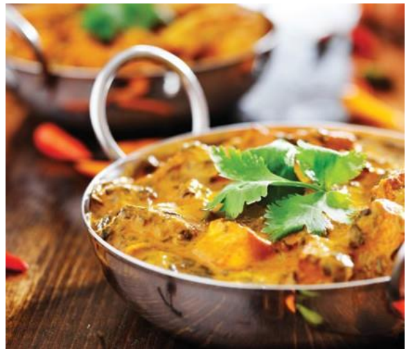
Shahi Paneer Curry

Try your hand at preparing staple Indian dishes under the watchful eye of your chef. Conclude the lesson by sampling the fruits of your labour.