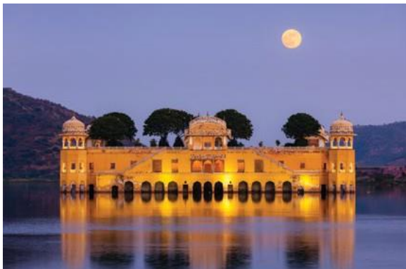
Jal Mahal, Jaipur

Visit the Gandhi memorial of Raj Ghat, Jama Masjid mosque and enjoy a rickshaw ride through the spice bazaar in Chandni Chowk. Later visit Humayun's Tomb and join Sikhism rituals inside Bangla Sahib Gurudwara. Stroll through the downtown market in Connaught Place before a welcome dinner in a local restaurant.