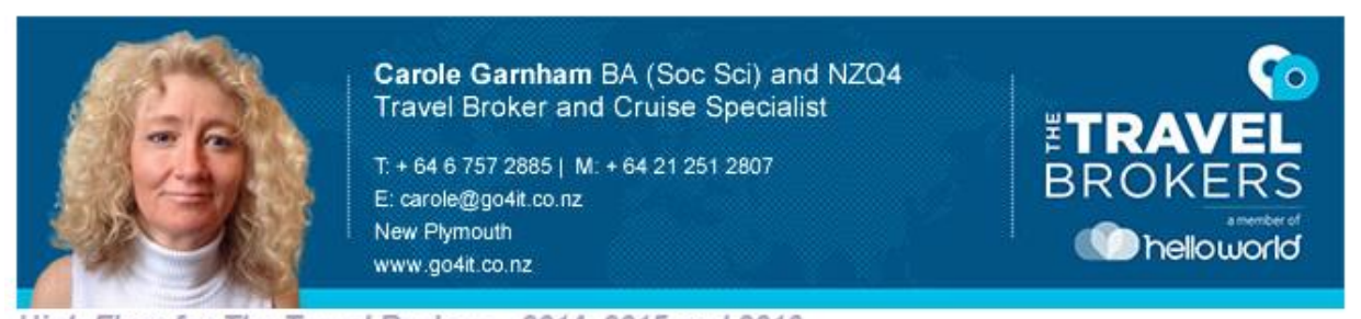
High Flyer for The Travel Brokers - 2014, 2015 and 2016

For enquiries or to make a booking please contact: